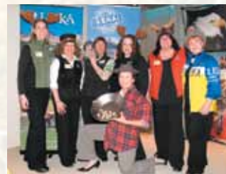
2009 Sales Mission in Germany

Great Alaska Sportsman Show Mat-Su Outdoorsman Show Fairbanks Outdoor Show Soldotna Sport, Rec & Trade Show Industry Appreciation Day Oxygen & Octane Winter Rec Show